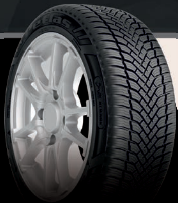
PT555 Multi Action