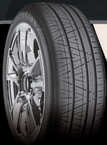
PT 731 Ultra Sport