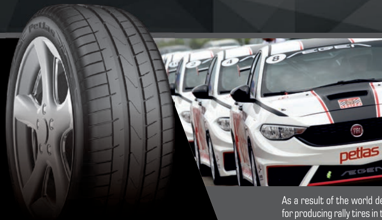
PT741 Velox Sport