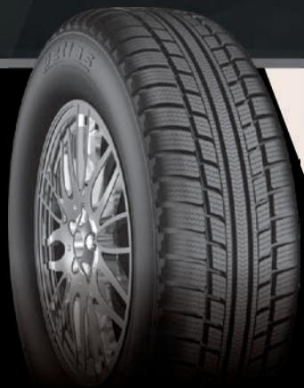
W601 Snow Master