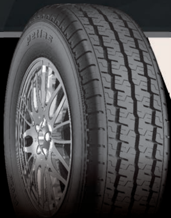
PT825 Full Power Plus