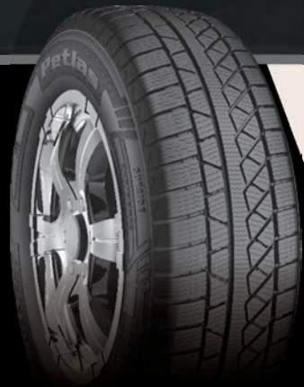
W671 Snow Master