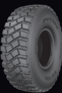
RM 900 Radial