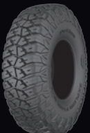
PT 451 EXPLERO Radial