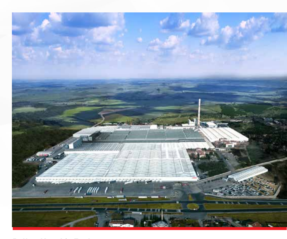
Petlas Kırşehir Factory

Petlas will continue its manufacturing activities without interruption. Petlas aims to continue to make the right investments and increasing its production capacity by building brand awareness while strengthened Petlas's growth momentum.